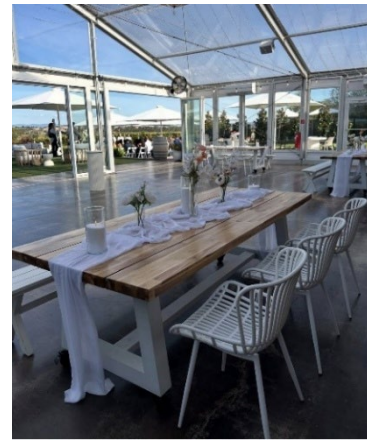
Table Setting: Styling optional through your florist or stylist

4 timber tables with a bench seat & 3 chairs either side 2 marble top bar tables